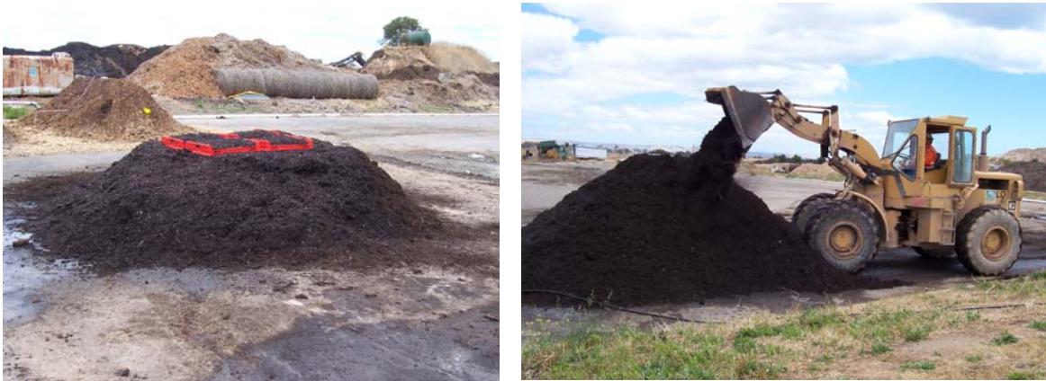
Figures 2 & 3: Establishment of the composting pile