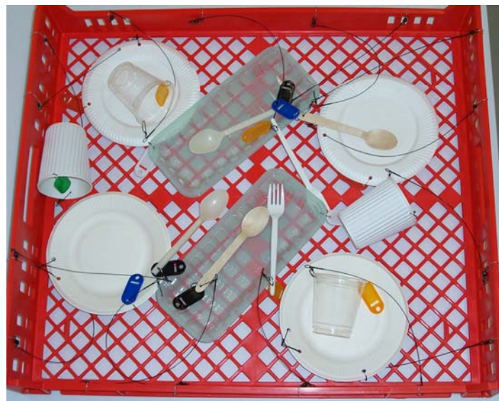
Figure 1: A typical sample tray prior to burial in a compost pile